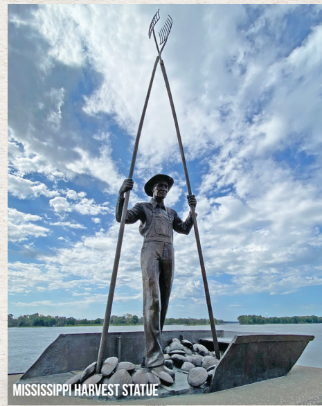
MISSISSIPPI HARVEST STATUE