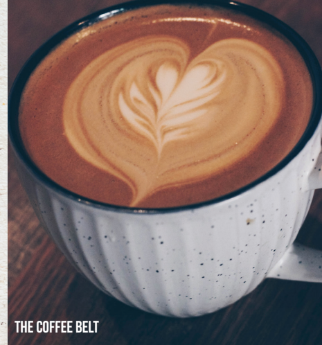
THE COFFEE BELT