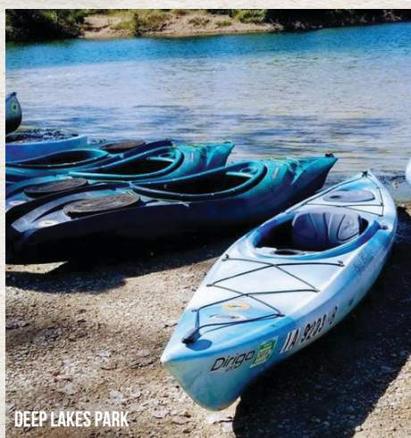
DEEP LAKES PARK